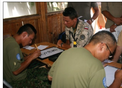
Writing in Japanese Calligraphy