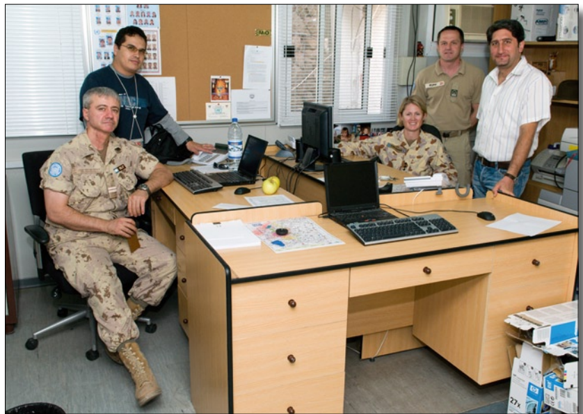
UNDOF CITS also support UNTSO-OGG with telephone and computer systems