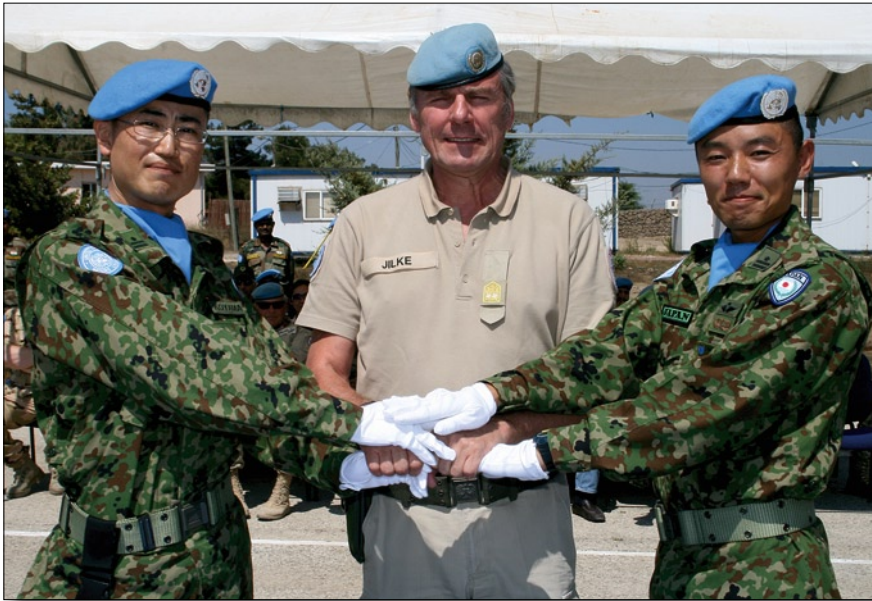
Handshaking after the signing ceremony

Once more six months have passed quickly and J-CON held their Change of Command (CoC) ceremony in Camp Ziouani on 2 nd Sept 2009.