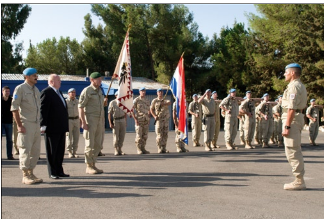
MGen Dieter Heidecker, Deputy Commander of the Joint Austrian Armed Forces, and an Austrian parliamentary delegation visited Camp Faouar and UNDOF Positions (29 th Sep - 2 nd Oct 2009)