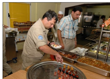
Enjoying Japanese food