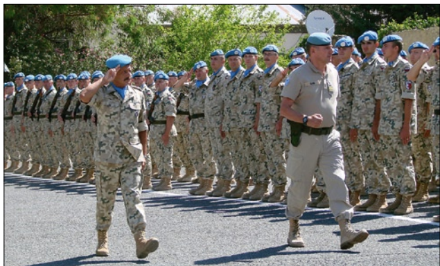
FC inspecting the troops

Polish peacekeepers serving on both the A-Side and B-Side on the Golan Heights celebrated their last Medal Parade in UNDOF attended by representatives of UNDOF Headquarters on 14 th of July.