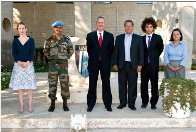
Mr. Ivan Lewis, Minister of State for Foreign and Commonwealth Affairs, the United Kingdom, visited Camp Faouar and Quneitra (4 th Aug 2009)