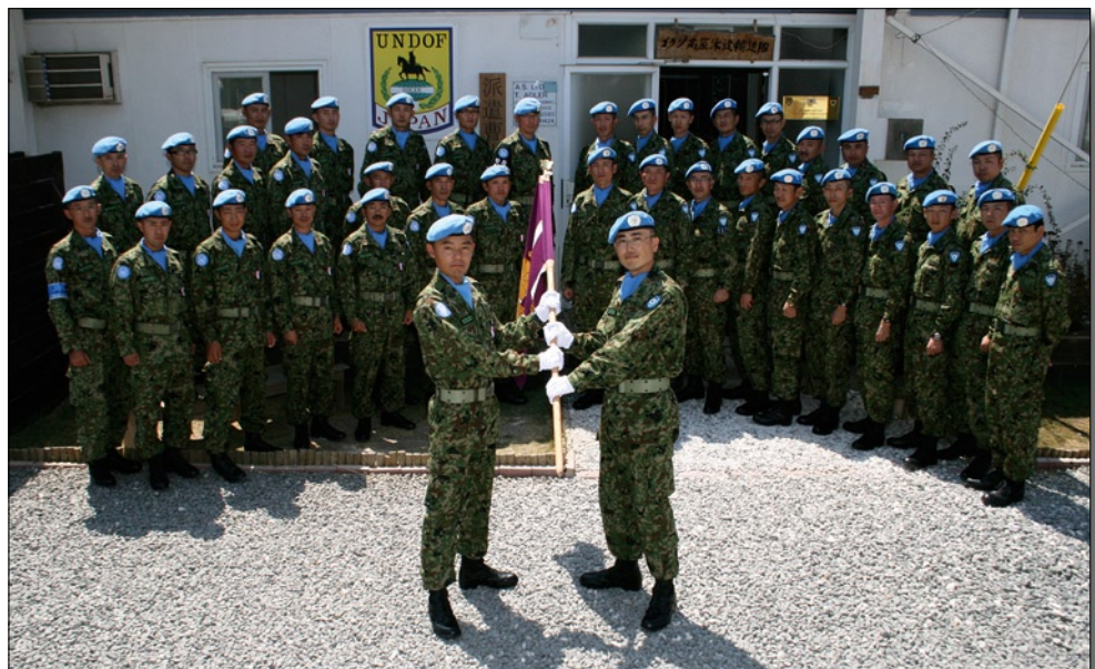
Handing over ceremony in Camp Ziouani