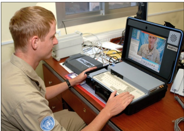
The Signals Officer establishing a link to Austria