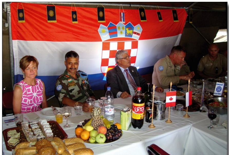
Croatian snacks were served for refreshment