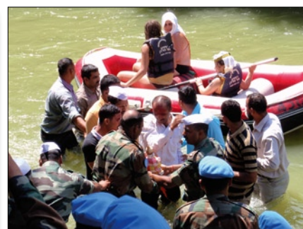
Visarjan concludes the ritual in the Jordan River