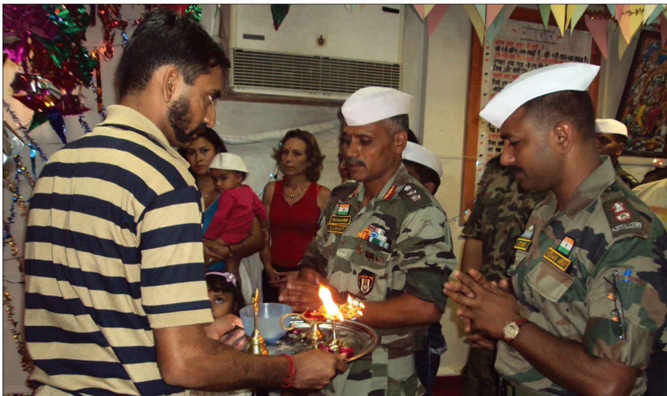
Devotees being blessed with sacred fire at Ganesha's temple

the headless body of Parvati's son and breathed life into him. Parvati was overjoyed and embraced her son, the elephant-headed boy whom Shiva named Ganesha, the lord of his hordes. Parvati was still upset, however, so Lord Shiva announced that everyone who worships Ganesha before any other form of God is favored.