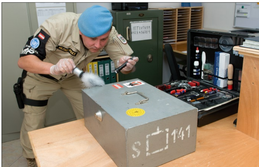
The investigator uses state of the art equipment to find traces

A fter hard month of duty finally you are enjoying your off days on the Mediterranean or Red Sea. Coming out of the refreshing water you are going to take a sunbath at your stretcher and suddenly you recognize that your bag with all your belongings like camera, mobile phone, mp3-player and your wallet with all ID cards, bank cards and your money is gone. Unfortunately, situations like this are hap-