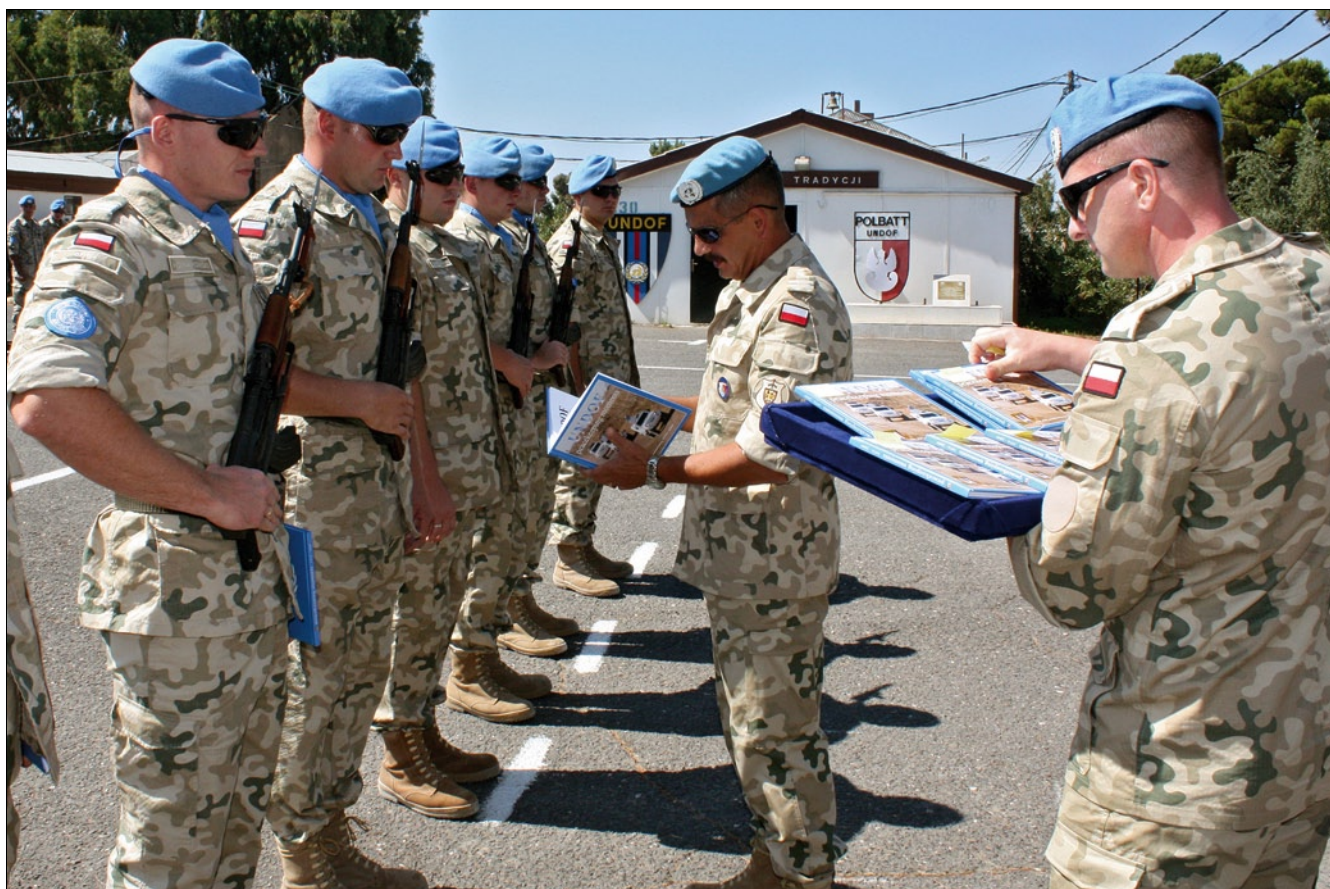
CO POLBATT hands over the treasured UNDOF Photo Book as a special present