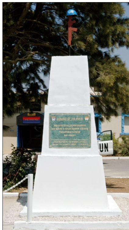
"Minaret of the Brave"

nine from Poland, seven from Finland and two from Ireland.