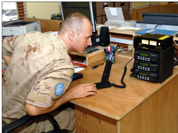
The Duty Officer on the radio

The OpsInfo Officer's primary task is to deputize COO in case of absence so he is supposed to know what is going on concerning operations. Apart from this he is in charge of situational updates regarding politics in the region and advises the CO in security matters. He also acts as the Press Officer of the bat-