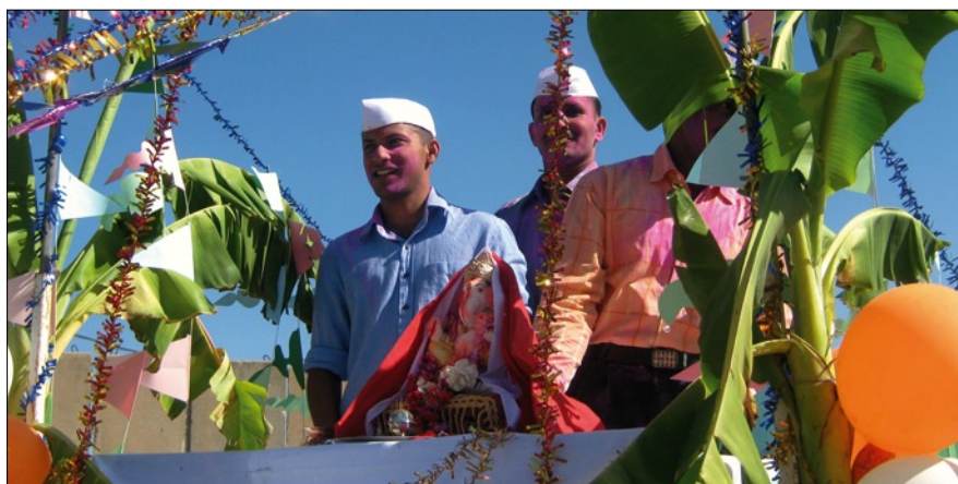
Indians warship Ganesha