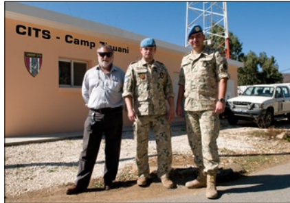
The CITS team in Camp Ziouani