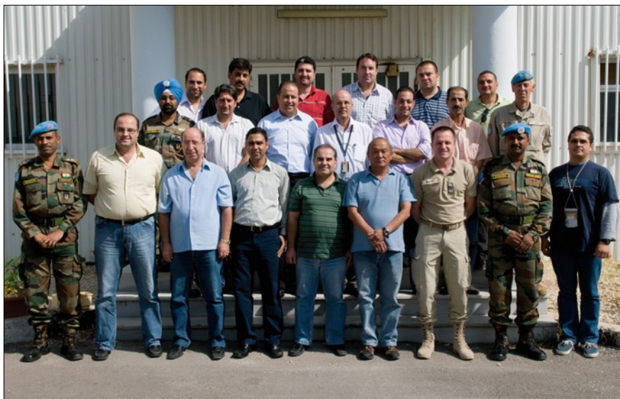
The CITS team outside their building in Camp Faouar

CITS is responsible for providing information and communications technology (ICT) services and support to all UNDOF civilian and military colleagues in all locations. ICT is a key strategic enabler for UNDOF and facilitates the utilization of new technologies for strategic advantage as well as allowing technical innovation to provide value to our complex and dynamic operations. CITS provides a complete computer based office work environment including access to enterprise information systems and telecommunication services including military and civilian pattern radio networks, telephony and facsimile capabilities. CITS personnel design, install and maintain complex voice and data networks using only in-house capabilities. They manage an inventory of around $7 Million and have an annual budget of around $2.5 Million. The ICT