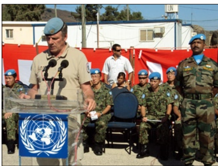
FC congratulates on Independence Day