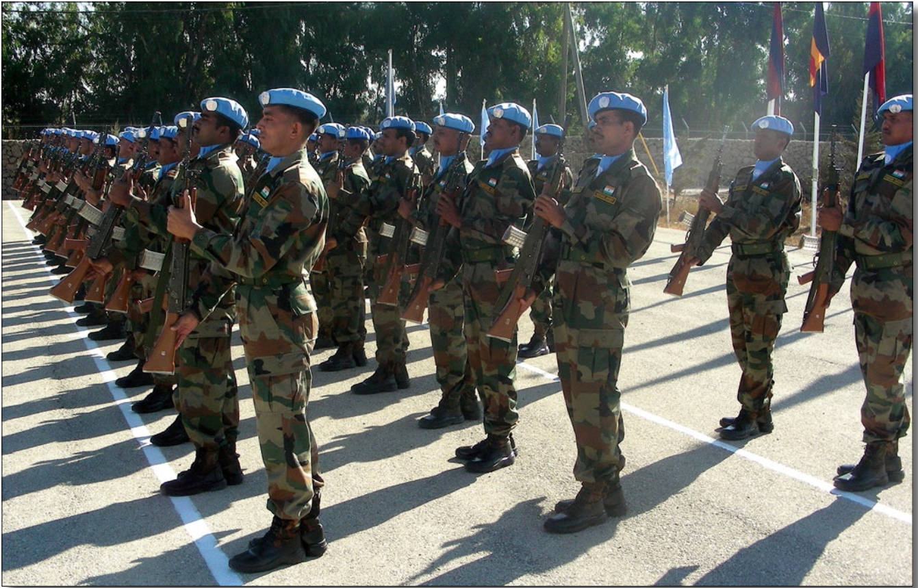
Indian peacekeepers present arms

The 62 nd Independence Day of India was celebrated in Camp Ziouani by the Indian contingent on 15 th Aug 2009. It was on this day in 1947 that India got its independence from British Rule.