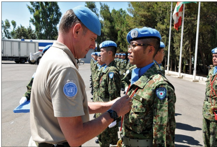
Receiving the medal by the FC