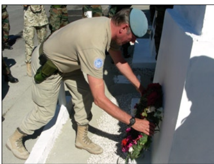
FC honors fallen comrades