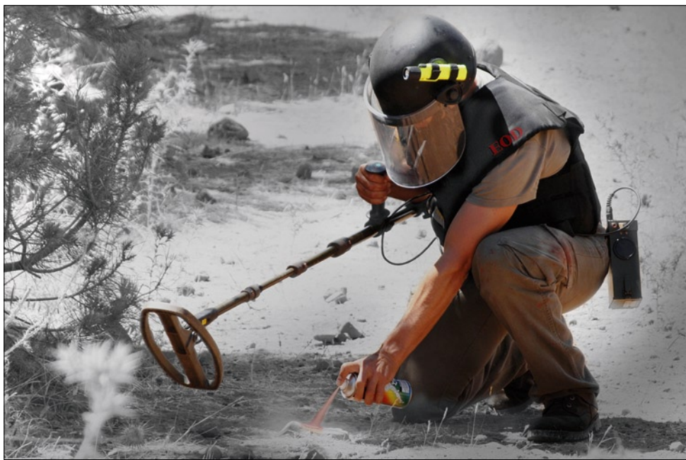
Checking a patrol track

won't listen and obey the agreement it is the Ops-Branch who carries out liaison with the „Muktars“ and underlines the Coy's efforts by making contact with the local police forces.