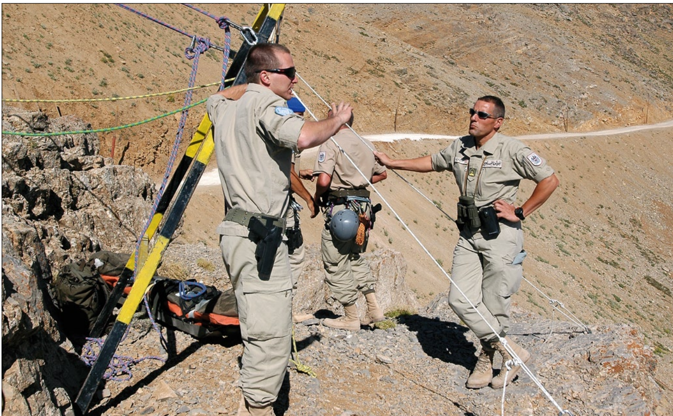
The COO supervising an exercise in the mountain area

The Signals Officer takes care that all means of communications are working as they should and that everybody has the ability to do proper reporting. Without his highly appreciated work the whole Ops-Branch would be numb and deaf and thus not operational.