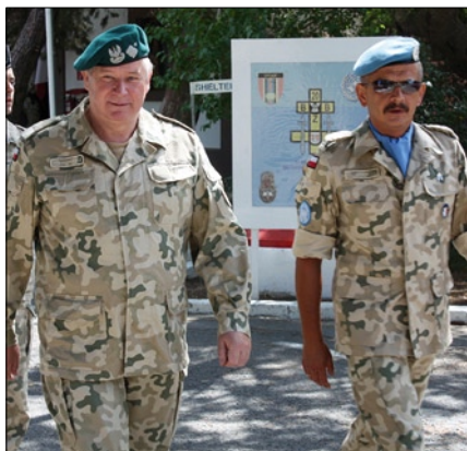
A high ranking guest on the Golan

During their last gala soldiers and employed specialists of the army were awarded with the UN Medal without neglecting the operation and mandatory tasks in POLBATT's area of responsibility. All who gathered for the gala were welcomed by the Contingent Commander of the 31 st Polish