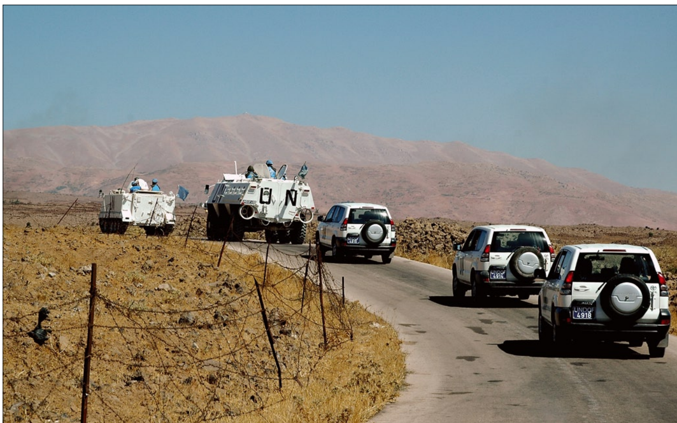
Patrolling the Area of Separation