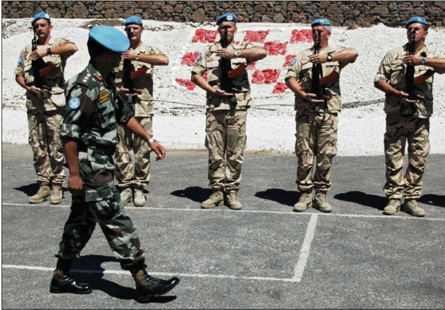
Salute to Chief of Staff

Far away from our homeland on Mission serving for UNDOF, the Croatian Contingent still fosters traditions like celebrating the Victory Day and Thanksgiving Day.