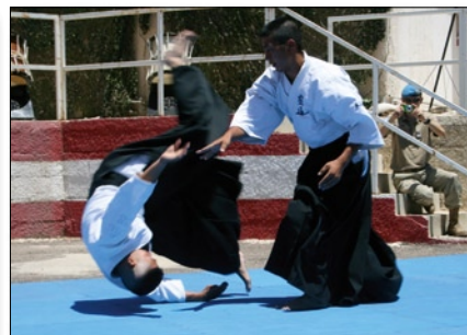
Throwing in Karate

In addition many guests took this opportunity for collecting souvenirs like their names written in