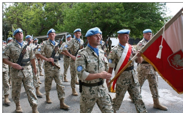
Polish peacekeepers parade after the ceremony

At the final part of the gala Polish cuisine, prepared by our cooks, was served to all the participants of the Medal Parade in the traditional manner. As always, the most popular dishes were the so called "bigos" and polish sausage. Using this occasion for friendly conversations with members of other contingents, we