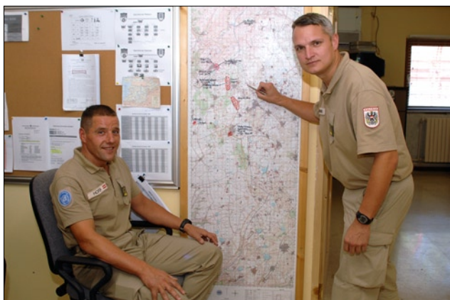
Incoming and outgoing COO discussing operational matters

The Duty Office is an equally important part of the Ops-Branch. It is the place where all the operational information comes in from the line companies. The Duty Officer keeps the operational maps updated and has to make the first decisions in case anything happens out in the Area of Separation. This demands a witty mind and exact knowledge of