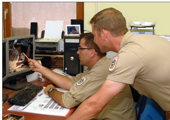
The OpsInfoO and the photographer at work

the area as he is the one to direct elements to the spot and calls in the Rapid Reaction Group (RRG) if needed to reinforce our troops on the spot.