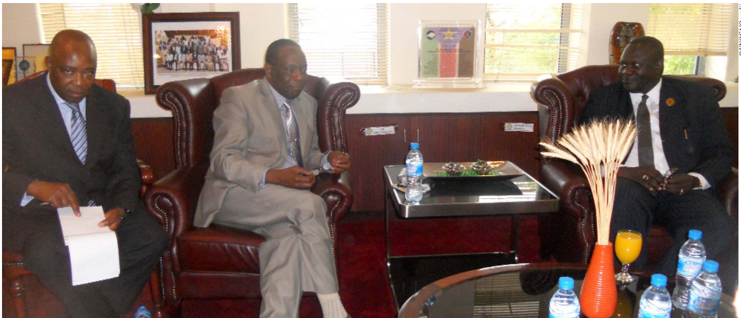
Mr. Riek Machar Teny Dhurgon, Vice-President of South Sudan (right) during a meeting with the Head of UNOCA (left) and the AU Special Envoy for the LRA (middle)

African States to deal with new and emerging threats, including maritime piracy, human trafficking, the proliferation of small arms and light weapons and insecurity on the high-ways connecting states in the sub-region. The message emphasized the need for collective action as the most effective way to deal with those threats. The Secretary-General also reiterated the United Nations' support to ECCAS Member States and the population of the sub-region "in their efforts to definitively end violence and to foster the entrench-