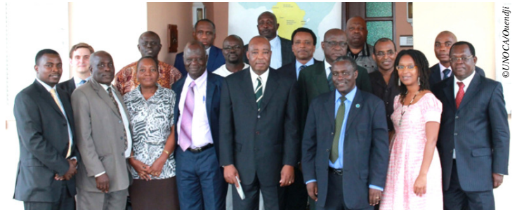
14 November: the Special Representative and the participants in the workshop on mediation