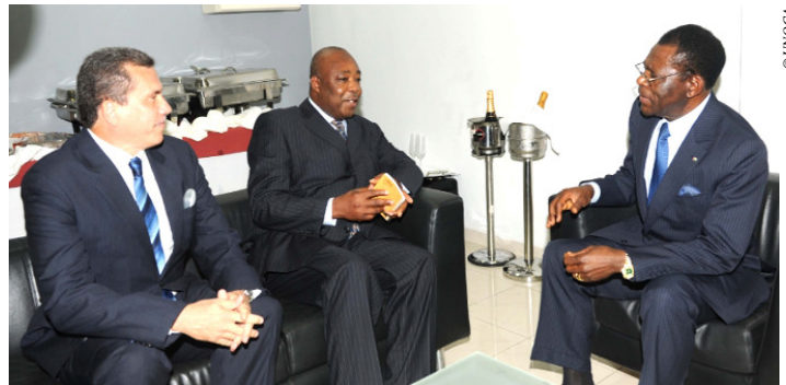
Audience with President Obiang Nguema Mbasogo on 11 November in Malabo